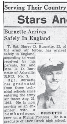
Harry's service announcement from newspaper